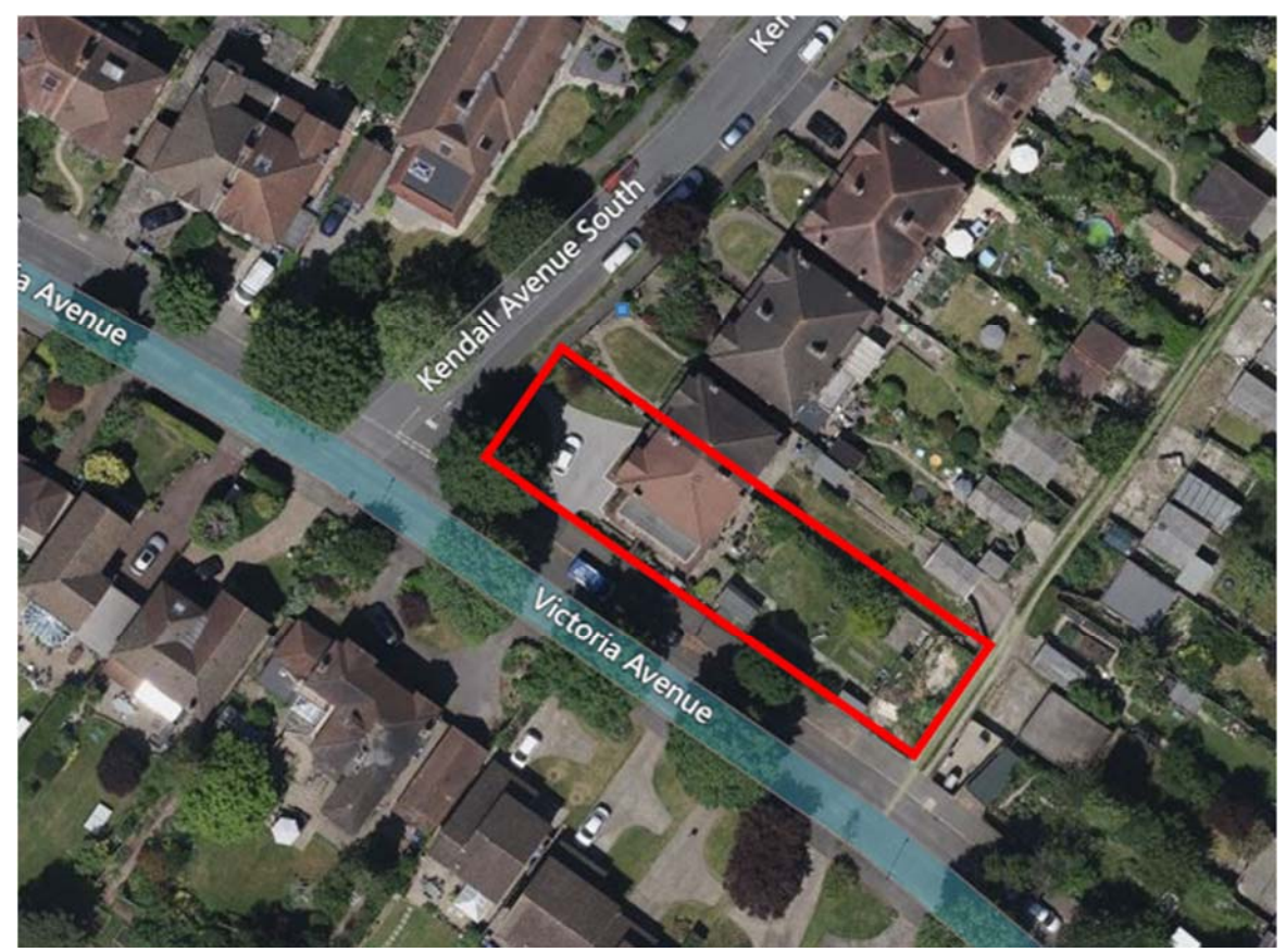
Figure 2: Aerial street view within the surrounding streetscene