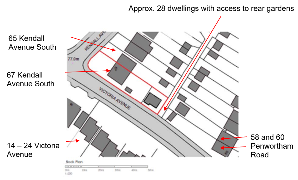
Figure 4: Proposed Site Location Plan showing neighbouring properties

8.18 The properties that have the potential to be most affected by the development are the adjoining properties at 65 and 67 Kendall Avenue South, 12 – 14 Victoria Avenue, 58 and 60 Penwortham Road, and neighbours with access from the rear.